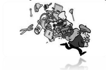
Fig.: Theft of Assets*